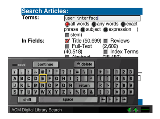
Figure 2 Microsoft's WebTV virtual keyboard

• Virtual Keyboard: The virtual keyboard (Figure 2) solution is very effective with naïve users. Except from cursor movement and selection, no further knowledge is needed. The virtual keyboard is slow and confusing with expert users.